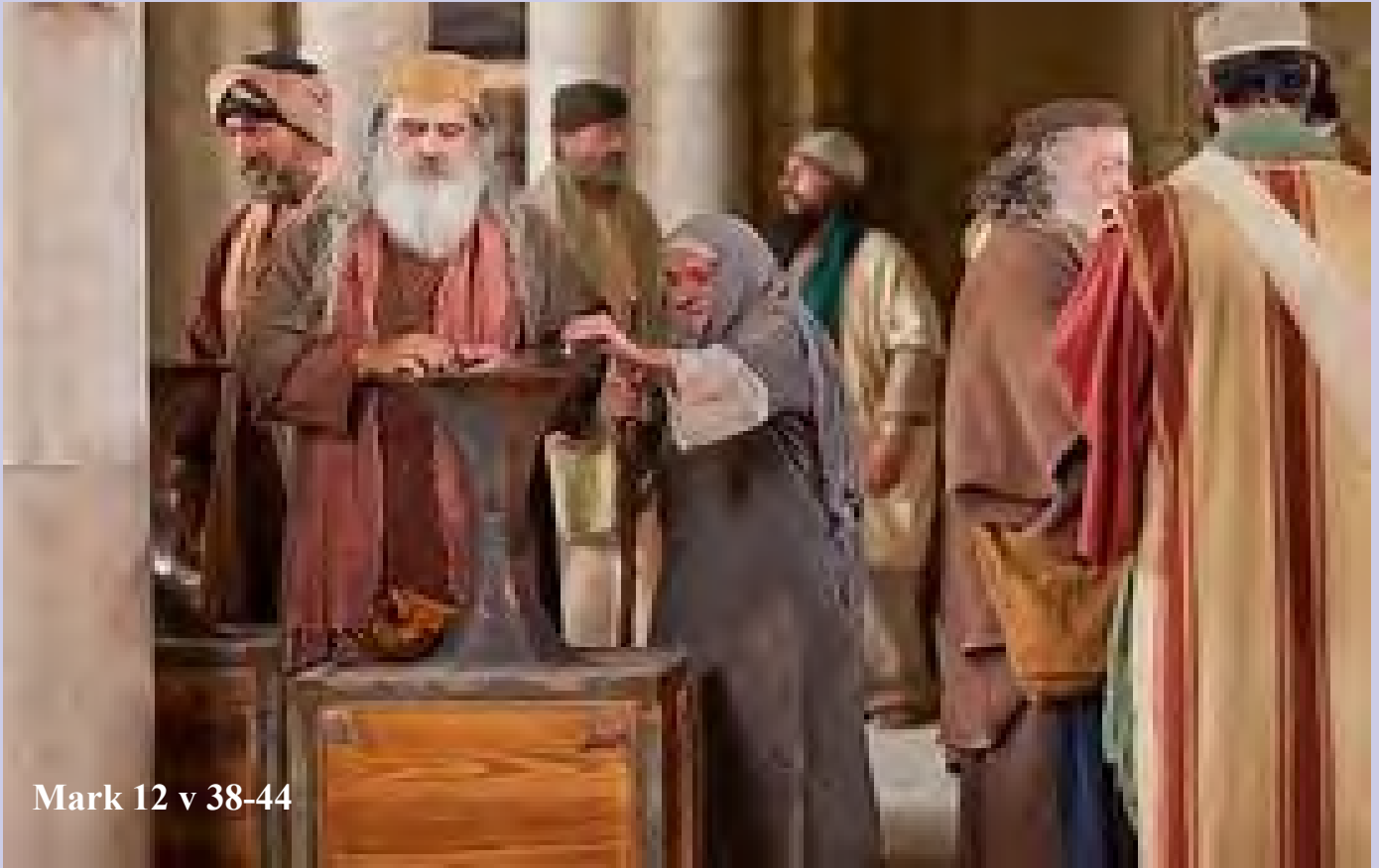
Mark 12 v 38-44