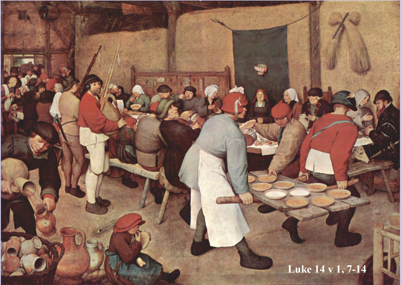
Luke 14 v 1, 7-14